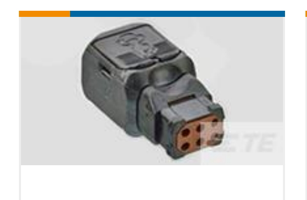
TE Part #D369-R66-NP1 369 6 WAY REC, CRIMP, PIN