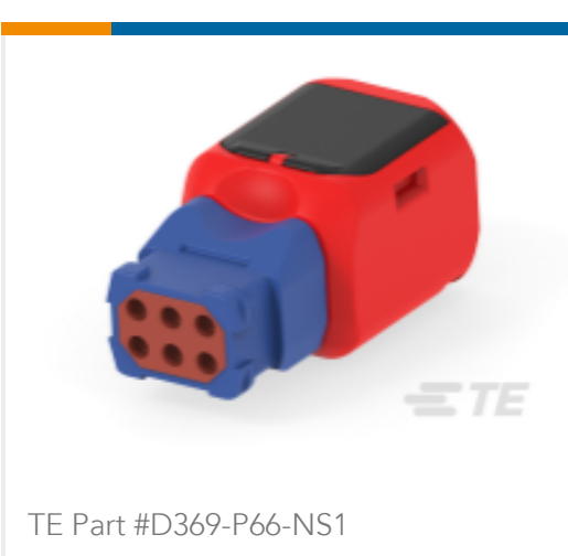
Rectangular Connectors, 6 Way Plug