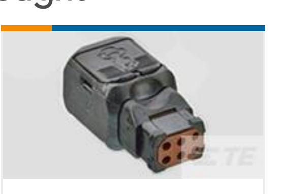
TE Part #D369-R66-NS1 369 6 WAY REC, CRIMP, SKT