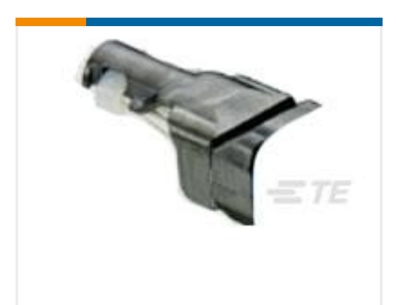
TE Part #D369-STB-3 369 3 WAY BACKSHELL STRAIGHT TIE WRAP