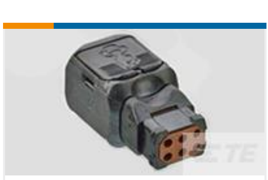
TE Part #D369-R66-BS0 369 6 WAY REC, NO CONTACTS, SKT