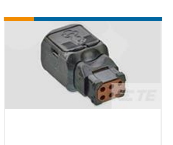
TE Part #D369-R66-NP0 369 6 WAY REC, NO CONTACTS, PIN