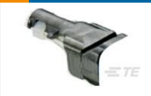
TE Part #D369-STB-9 369 9 WAY BACKSHELL STRAIGHT TIE WRAP