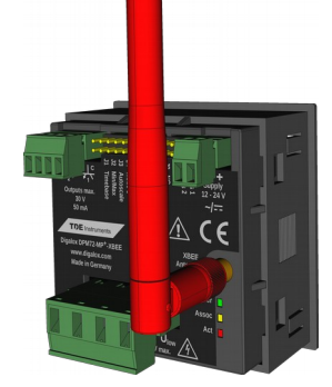
XBEE Wireless transmission via 2,4 GHz mesh network