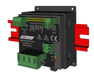
Ohne Display Mounting on DIN rail for XBEE and Modbus