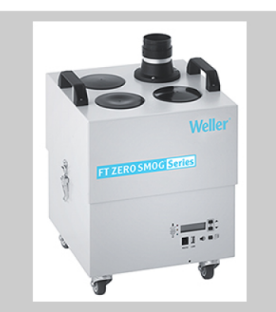
Fume extraction devices