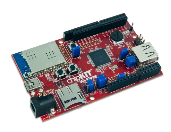
The chipKIT Wi-FIRE board.