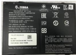
BTRY-ET5X-10IN5-01 10 in. Tablet Internal Battery