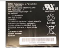
BTRY-ET5X-8IN3-01 8 in. Tablet Internal Battery