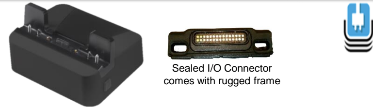
CRD-ET5X-1SCOM2R 1-Slot Dock with Rugged IO Adapter