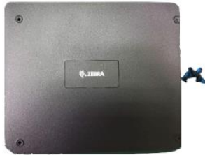
KT-ET5X-8BTDRSA1-01 ET51/ET56 8" Battery Cover Attached with Screws (Included)