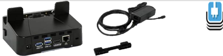
CRD-ET5X-1SCOM1 ET5X 1-Slot Charge and Communication Dock