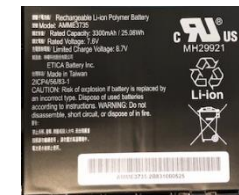
BTRY-ET5X-10IN3-01 10 in. Tablet Internal Battery