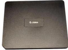
KT-ET5X-8BTDR2-01 ET51/ET56 8" Battery Door