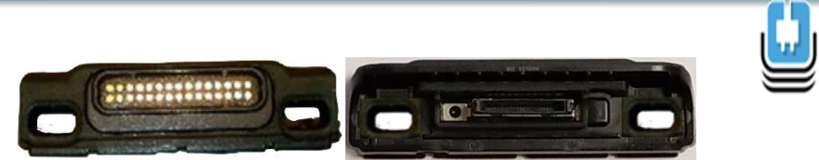
SG-ET5X-RGIO2-01 Replacement Rugged I/O Connector