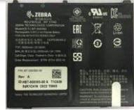
BTRY-ET5X-8IN5-01 8 in. Tablet Internal Battery