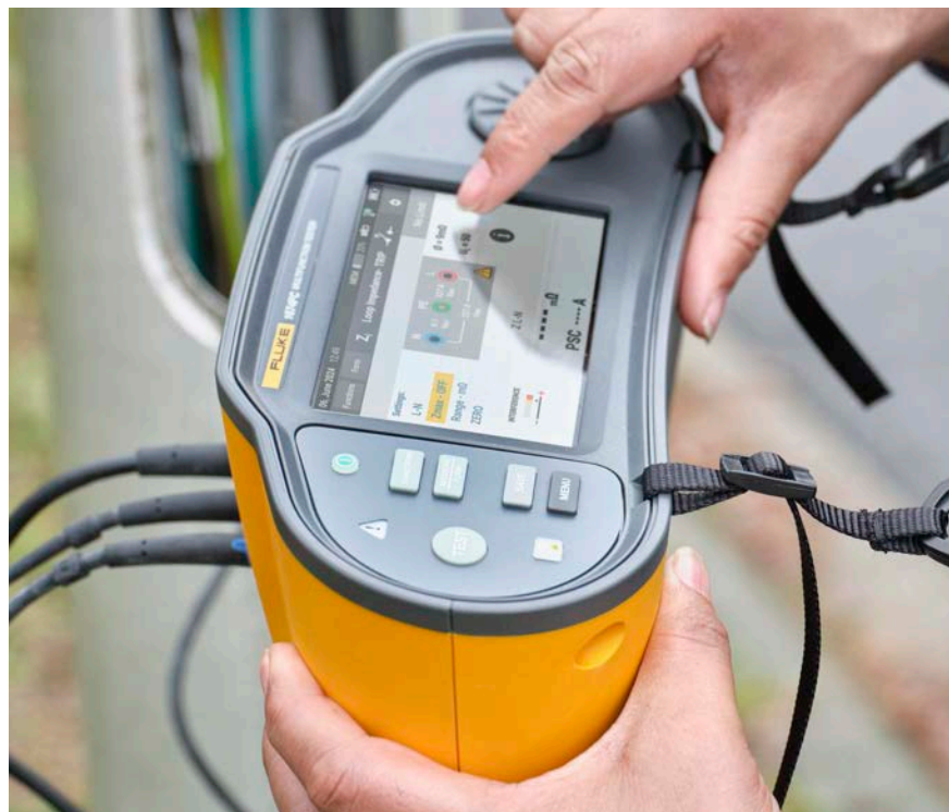
Full-color touch screen and tactile rotary knob for fast navigation

Simplify report generation with automatic report population, Fluke Connect integration, and one-touch reporting with Fluke TruTest™ software.