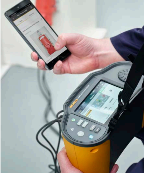
Assign photos directly to specific test points for more detailed documentation