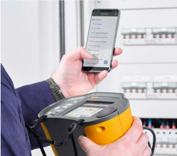
Reduce manual data entry and recordkeeping