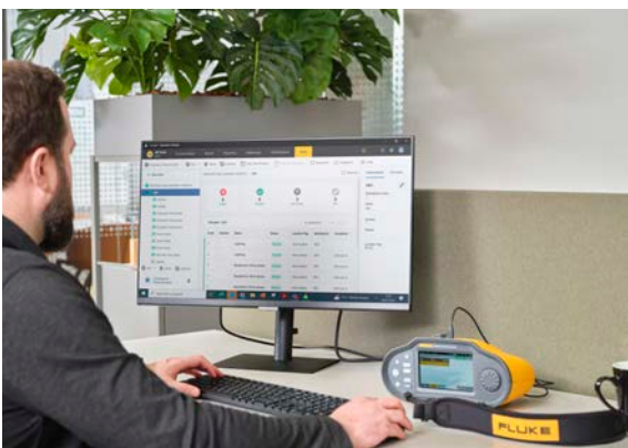
TruTest Software simplifies electrical system data management and reporting

The Fluke 1674 FC includes a patented Insulation PreTest, so you can better protect the installation and avoid costly mistakes. If the tester detects that appliances are connected to the system during the test, it will stop the insulation test and provide a visual and audible warning. This helps eliminate accidental damage to peripheral equipment and saves you both time and money.