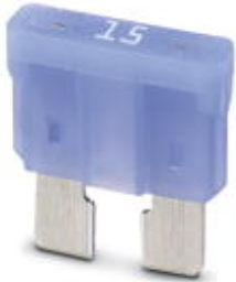
Fuse, nominal current: 15 A, length: 19 mm, width: 5 mm, height: 13 mm

Please be informed that the data shown in this PDF Document is generated from our Online Catalog. Please find the complete data in the user's documentation. Our General Terms of Use for Downloads are valid ( http://phoenixcontact.com/download )