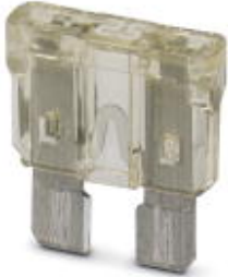
Fuse, nominal current: 25 A, length: 19.1 mm, width: 5 mm, height: 18.8 mm

Please be informed that the data shown in this PDF Document is generated from our Online Catalog. Please find the complete data in the user's documentation. Our General Terms of Use for Downloads are valid ( http://phoenixcontact.com/download )