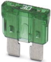
Fuse, nominal current: 30 A. Length: 19.1 mm, width: 5 mm, height: 18.8 mm

Please be informed that the data shown in this PDF Document is generated from our Online Catalog. Please find the complete data in the user's documentation. Our General Terms of Use for Downloads are valid ( http://phoenixcontact.com/download )