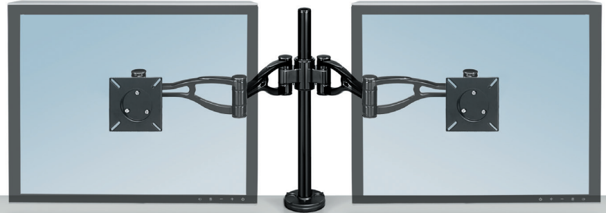
8041701 Professional Series Depth Adjustable Dual Monitor Arm

HELPS REDUCE neck strain and shoulder tension