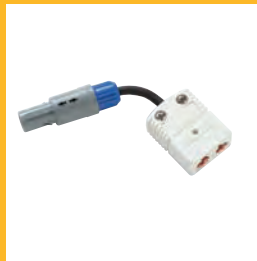
Universal Thermocouple Adapter