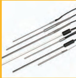
Calibrated Temperature Sensors

A wide array of accessories is available to help you maximize productivity, but the following are essential for most users.