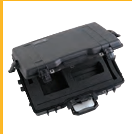
Probe and Readout Case