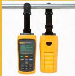
TPAK Meter Hanging Kit