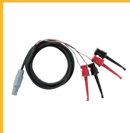
Universal RTD Adapter