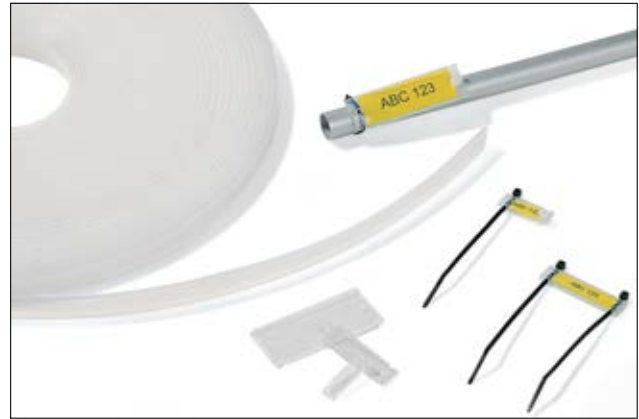
Multi-purpose identification potential: Helafix HC and HCR.