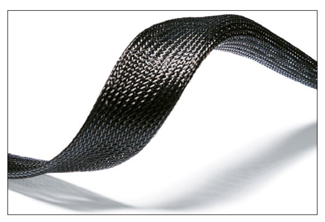
Helagaine HEGPL Braided Sleeving.

Braided sleeving made of flame-retardant polyethylene can be found in the Engineered Solutions Catalogue.