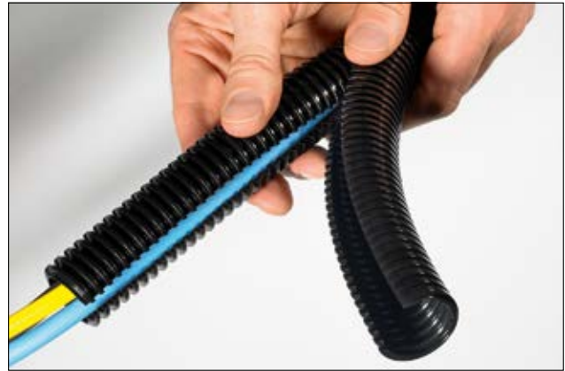
HelaGuard HG-DC double slit conduit is ideal for retrofitting.