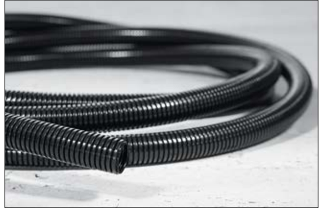
HelaGuard HG-LW is very light and flexibel.