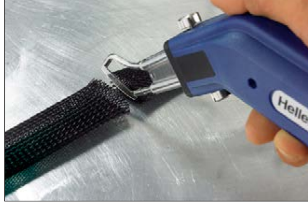
The HSGO hot cutting tool prevents the braided sleeving from fraying.

A replacement blade is available with the item number 170-99002.