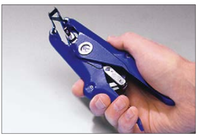
Fast, secure application with the three-pronged expansion tools.