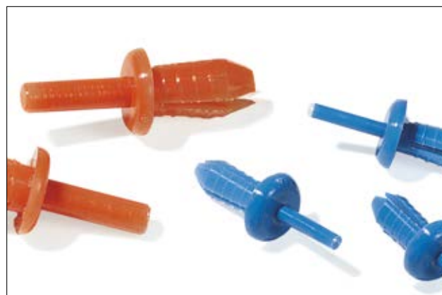
HTWD-R4 and HTWD-R6 Rivet.