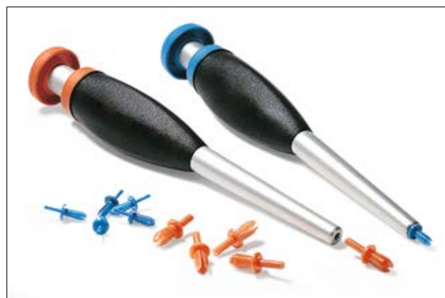
Rivet Tools HTWD-RT4, -RT6.