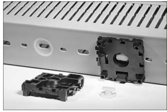
HTWD-RB rail mounting blocks for mounting ducts to DIN rails.