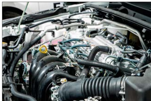
SA47-HT provides optimum protection against moisture in high temperature applications.