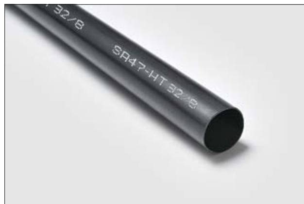
Heat shrink tubing SA47-HT for 150 °C application.