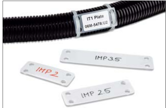
Unlimited cable bundle diameters can be securely identified.