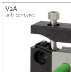
V2A anti-corrosive Also available with stainless steel screws (V2A).