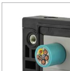
Also available with threaded bushings.