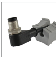
Slit KT grommets