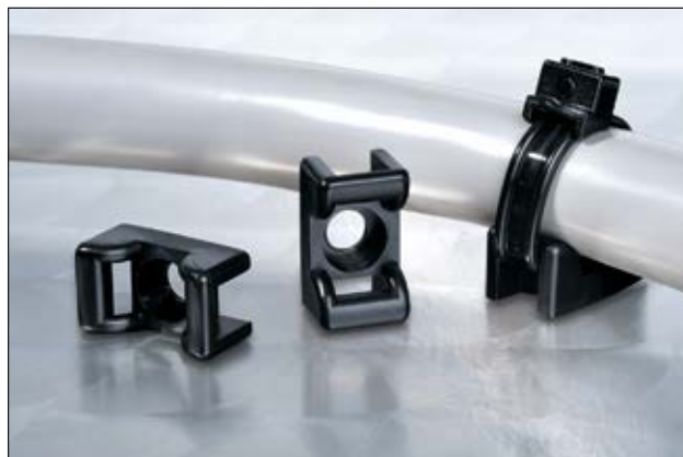
Cable Tie Mounts KR6G5, KR8G5 and CTM.