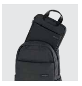
Multiple Carry Options

Keep accessories and adapters stowed and protected when not in use, while helping to avoid accidentally scratching or damaging the laptop or tablet.