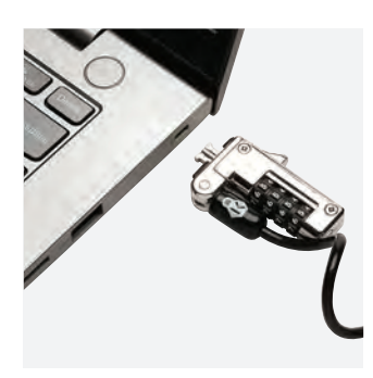
Won't Block Valuable Ports

Allows the laptop to lie flat and stable.