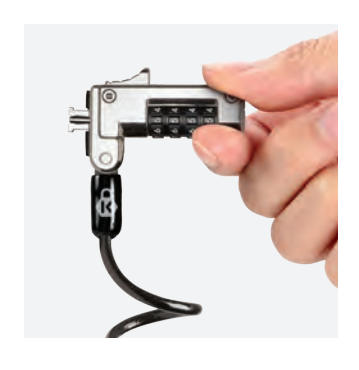
Pivot and Rotate Cable Head Featuring One-Handed Operation

Lets you choose from 10,000 possible combinations.