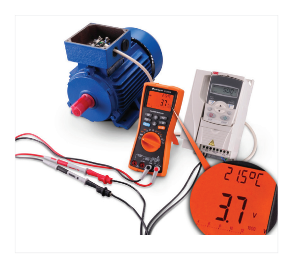
Figure 2. U1272A helps you identify the presence of stray voltage on a disconnected wire running parallel with the wire powering up the VFD to an industrial motor. The image on the right shows the U1272A in low impedance mode.