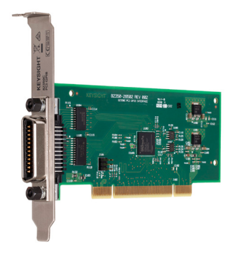
82350C with standard profile bracket

NOTE: When using 82350C with low-profile bracket, attach the 10834A GPIB-to-GPIB adaptor to increase clearance for GPIB cable or other connector.