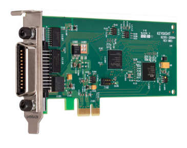
82351B with low-profile bracket