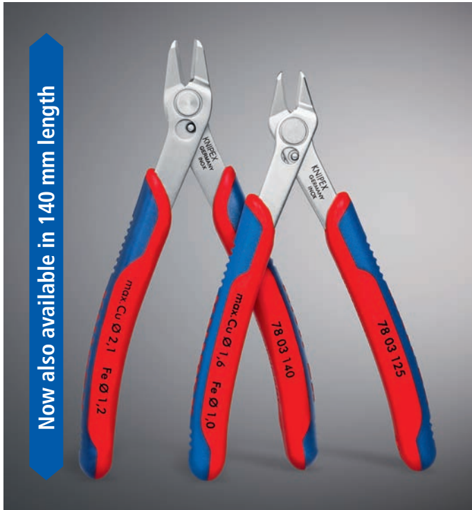
140 mm length: stronger and extremely versatile