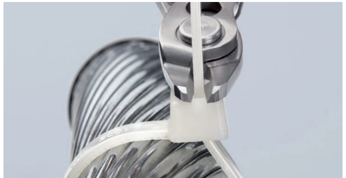
For flush cutting, e.g. to shorten cable ties