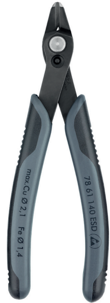
78 61 140 ESD