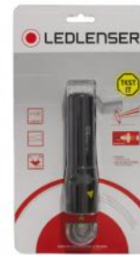
Exemplary Packaging Illustration