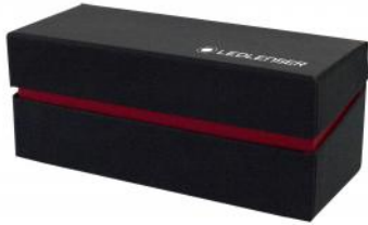
Exemplary Packaging Illustration