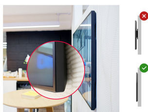
Zero-Gap Wall Mount

Designed to perform in continual, around the clock environments, the LH4370UHB can be installed and utilised in landscape and portrait orientation. The jaw dropping and best-in-class 25mm total depth (when used with the included proprietary brackets) will mean this display can be installed discreetly and elegantly in all areas.