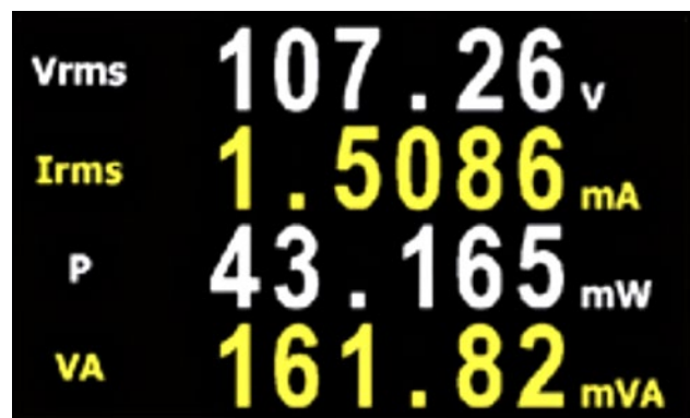
Simple Mode (4 Measurements)

T3PM1006 provides two display modes for various measuring situations. Standard mode displays 8 measurement parameters (2 major measurements + 6 secondary measurements) and related measurement setting parameters which is ideal for applications in R&D, design, and engineering verification. Simple mode displays four measurement parameters which can be useful in production environments.