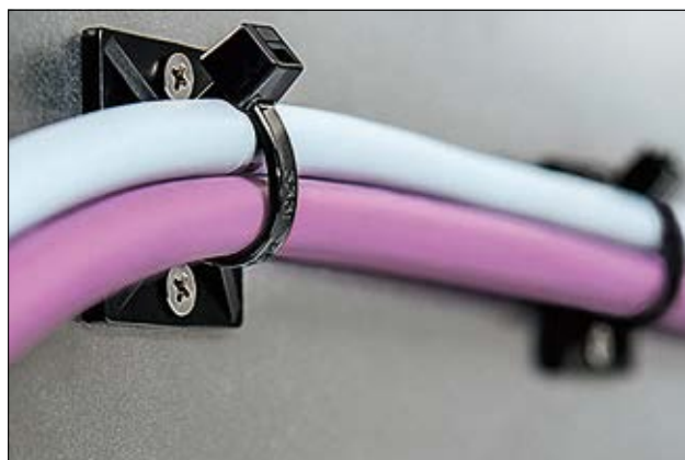
MB-Series Mounts with square design.