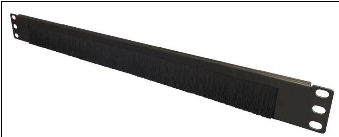
1U Open Brush Strip Panel (MBrushBK)

The brush strip panels enable the installer to organise the cabinet while minimising disruption of airflow. Unlike letterbox-style brush panels, our single sided panels offer the advantage that one item can be used for both a small or (by using 2 pieces, one inverted) a large opening.