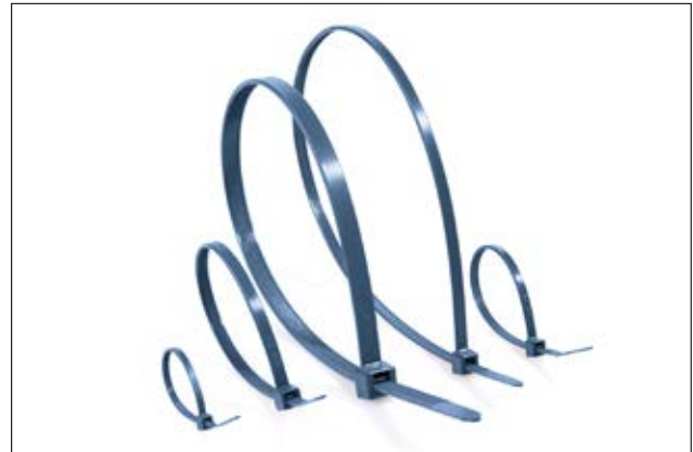
MCTPP ties have a high chemical and temperature resistance.