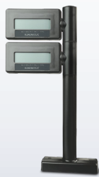
90ACC0343 Dual Display/Single Interval