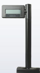
90ACC0340 Single Display/Single Interval