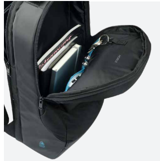
With organizer and keyring