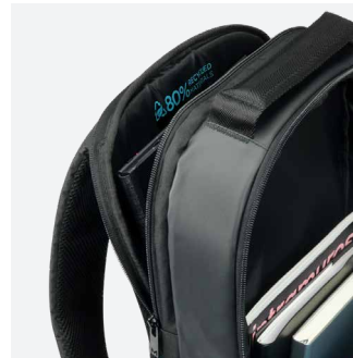
With tablet storage pocket