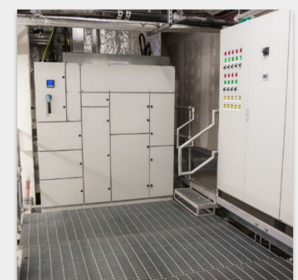
Monitoring of heating, ventilation and air conditioning systems