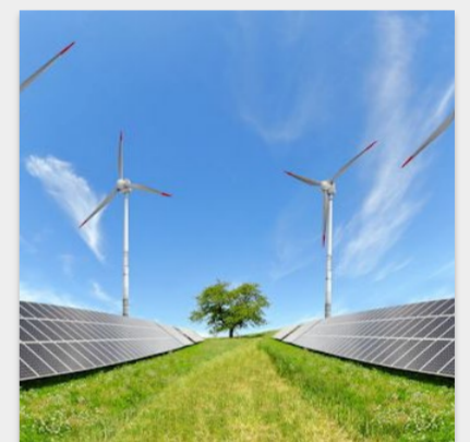
Intelligent control of power grids