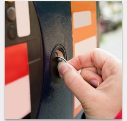
Monitoring of vending machines