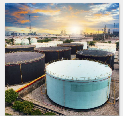
Monitoring of industrial plants