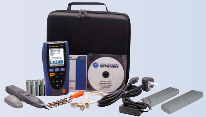
NavITEK II PRO - Premium kit