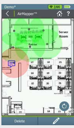
AirMapper™ Site Survey App