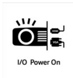
I/O Power On

With the HDMI Power On function, the projector is able to turn on automatically when the projector receives a signal via HDMI or VGA. You no longer need to start the projector separately, but can simply switch on your notebook, receiver or game console and the projector will automatically switch on as well.