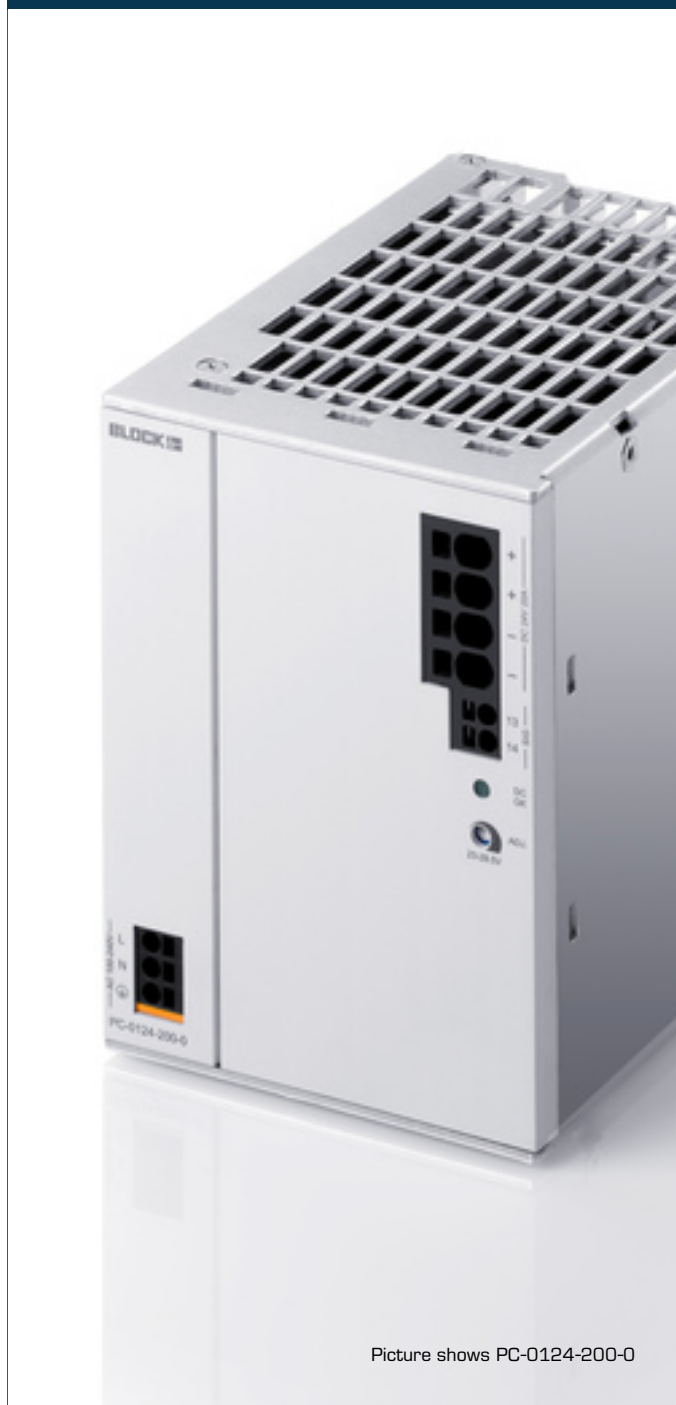
Picture shows PC-0124-200-0