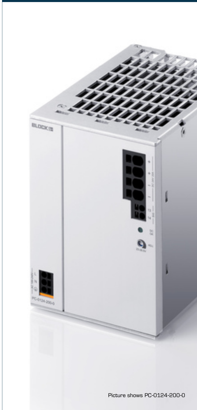
Picture shows PC-0124-200-0