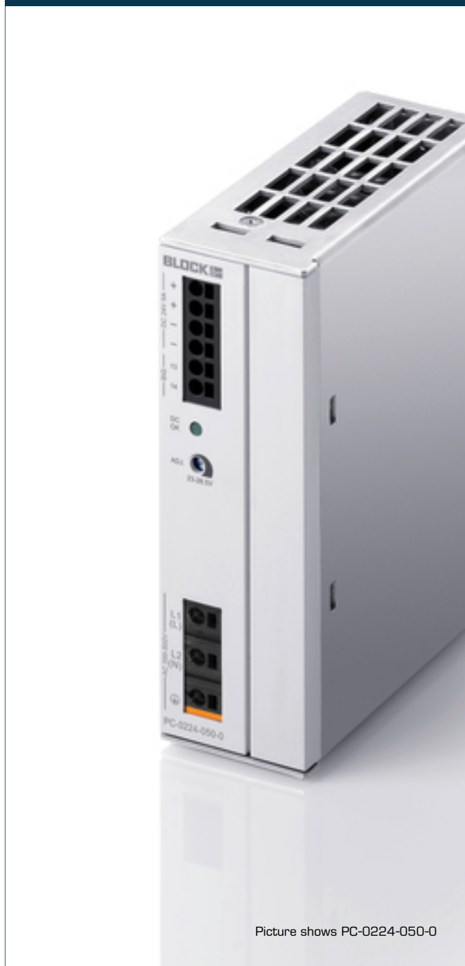
Picture shows PC-0224-050-0