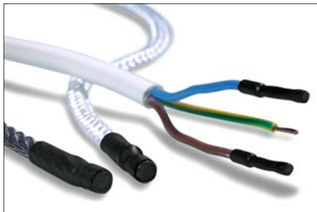
The appropriate end cap for every cable diameter, and cable types.