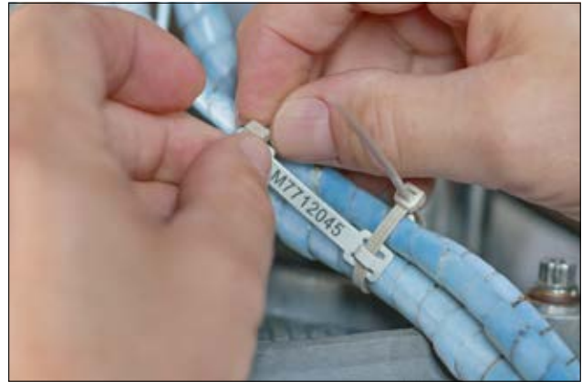
Outside serrated Cable Tie and Identification tag HFTP48 made from PEEK.