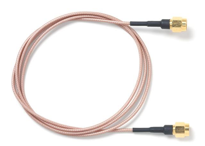
Model 4846-UU SMA Plug to SMA Plug, RG178B/U