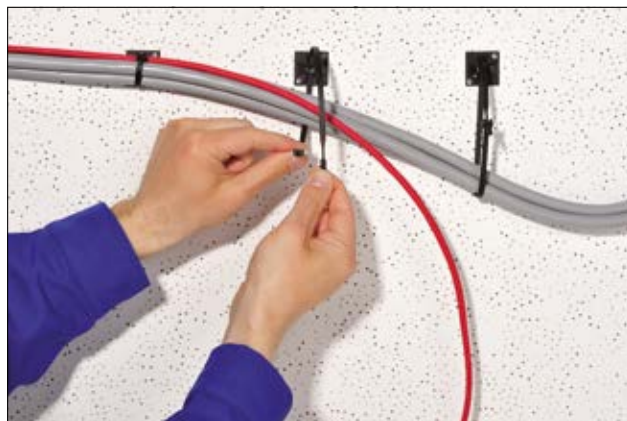
Q-ties can be used for both temporary and final cable installation.