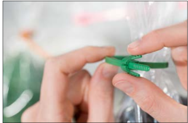
The inside serrated REZ ties have a one-hand, simple release mechanism.