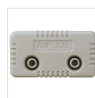
Current Extension Module