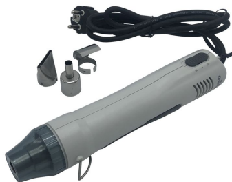
RND 555-00003 Low Temperature Mini Hot Air Gun