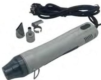
RND 555-00003 Low Temperature Mini Hot Air Gun